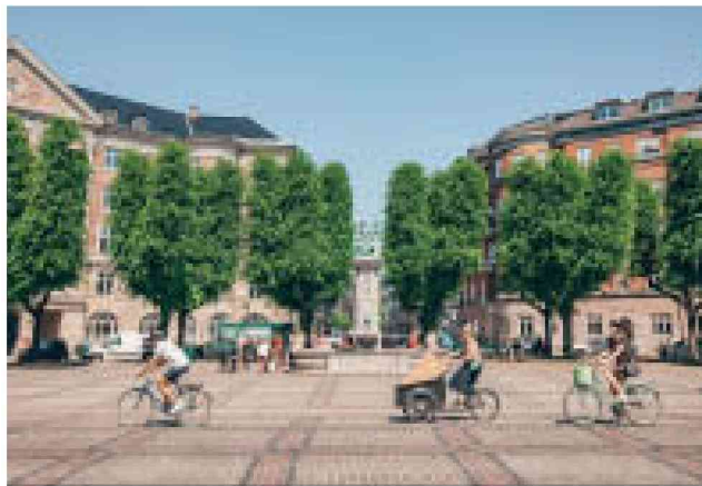
Cyclists in Copenhagen

Covid requirements: There are currently no entry requirements or Covid restrictions in place for Jersey .