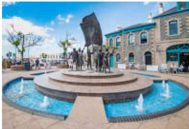
Liberation Square, St Helier, Jersey