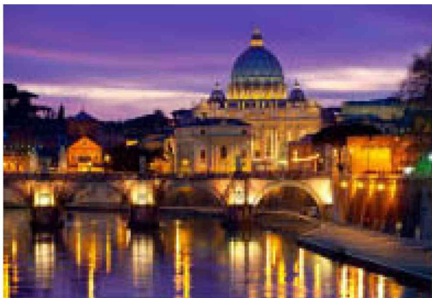
St Peter's Basilica in Rome at night

Source: Wirral Globe {Main} Edition: Country: UK Date: Wednesday 13, April 2022 Page: 24 Area: 739 sq. cm Circulation: ABC 68575 Weekly Ad data: page rate £1,512.00, scc rate £4.75 Phone: 0151 906 3045 Keyword: Jersey