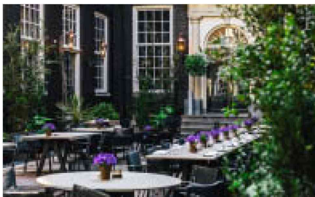
The Dylan in Amsterdam

Source: Wirral Globe {Main} Edition: Country: UK Date: Wednesday 13, April 2022 Page: 24 Area: 739 sq. cm Circulation: ABC 68575 Weekly Ad data: page rate £1,512.00, scc rate £4.75 Phone: 0151 906 3045 Keyword: Jersey