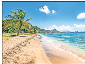
POPULAR... Saint Kitts, Caribbean

"Changes to restrictions and testing hampered it but now the UK is more consistent in its approach." And he did reveal that demand for city breaks in the UK is growing.