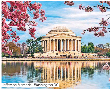
Jefferson Memorial, Washington DC

A spring fling in DC might be just the thing if you're craving transatlantic adventure. And the cherry trees will be in full bloom, turning pockets of the city pink; head to the Tidal Basin for the loveliest view. Where to stay? It has to be Riggs Washington DC, which opened last year in a cavernous former bank. Expect globally inspired drinks at its Silver Lyan bar, bespoke artwork in guestrooms and great views of the buzzing Penn Quarter below.