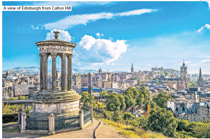
A view of Edinburgh from Calton Hill

a wee dram in the grand banking hall. Details Room-only doubles from £495 (geneagles.com)