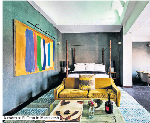
A room at El Fenn in Marrakesh

No city conjures perpetual fun quite like Tel Aviv — you'll find yourself heading home from the clubs around the port as