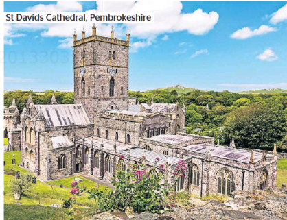
St Davids Cathedral, Pembrokeshire

In April swathes of tulips unfold across Amsterdam's parks and gardens, so time your visit to catch the spectacle. The annual Tulip Festival plants one for every resident — that's 800,000 blooms in the city alone. April brings