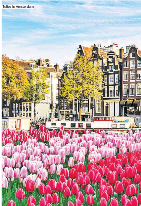
Tulips in Amsterdam

If you have energy to burn, sign up for the Berlin half marathon on April 3 — a breath-busting way to explore the city streets. Runners race from the Berliner Siegestaule victory column, passing the Schloss Charlottenburg palace, plus Checkpoint Charlie and the grand buildings of Gendarmenmarkt. You'll