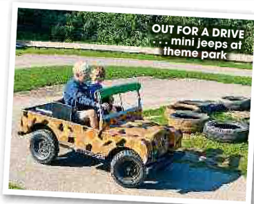
OUT FOR A DRIVE . . . mini jeeps at theme park

The Pound has risen seven per cent against the Cape Verdean escudo since the start of the year. Other top-value countries from the study include the European hotspots of Romania, Croatia, Poland, Portugal and Greece.