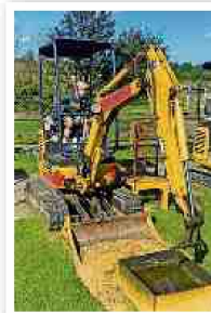
HOLED UP . . . Diggerland

● For more info, see experiencewakefield.co.uk